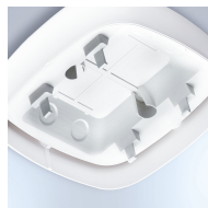
Optional surface-mounting adapters (IP 54, KNX)