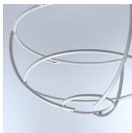
Optional guard cage