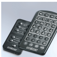
Optional remote controls